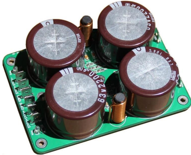
Fig.2 LPS212A Capacitor-filter board